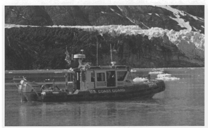
Coast Guard Small Boat at a Forward Operating Location in September 2008

To evaluate activity trends in the Arctic, the Coast Guard commenced extensive Arctic Domain Awareness flights. Coast Guard C-130 Flights originated out of a temporary Forward Operating Location in Kotzebue last summer and will continue later this summer. These flights help develop a complete awareness of all private and governmental activities in the Arctic.