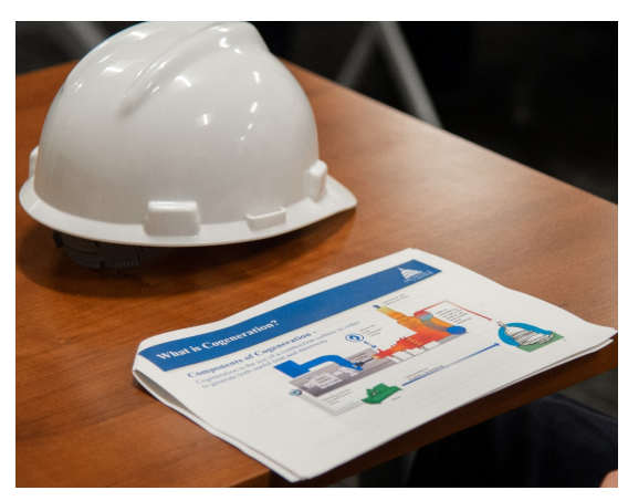
THE AOC'S RISK-BASED PROJECT PRIORITIZATION PROCESS STRATEGICALLY IDENTIFIES PROJECTS

Adhering to a plan is important to me. Each year we use a risk-based process to prioritize needed projects. In FY 2020, we are requesting $175 million for projects that will provide necessary maintenance to our energy delivery infrastructure, facilitate the next presidential inauguration as well as enhance security measures around the campus.