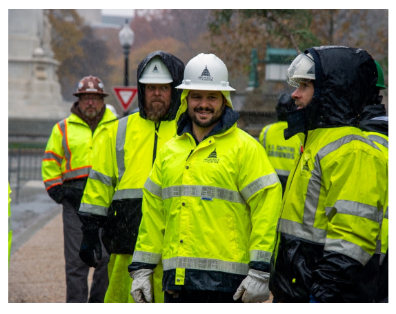
RESOURCES ARE NEEDED TO KEEP PACE WITH GROWING OPERATIONAL AND PROJECT SUPPORT REQUIREMENTS

oversight of fire and safety operations. The AOC must also update and improve several critical information technology systems which we have identified