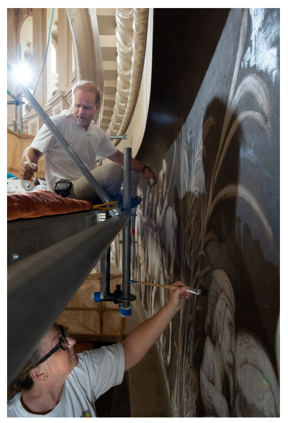
CONSERVATION WORK ON THE ROTUNDA FRIEZE

Our heritage assets include buildings, monuments, landscapes, fountains, fine art, archival records and botanic assets. Their value is priceless. Over the last several years, we have expanded our foundational preservation documents, including building preservation guides and cultural landscape reports. We use these documents and our historic preservation policy as planning tools for restoring, renewing and reclaiming our heritage assets to a standard that is appropriate for the nation's capital and the worldwide symbol of American democracy.