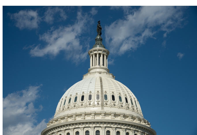
U.S. CAPITOL DOME AND THE STATUE OF FREEDOM

Prior to becoming Acting Architect of the Capitol, I spent eight years as the Deputy Architect of the Capitol and the Chief Operating Officer. I learned much about the agency, Congress and the needs of the Capitol campus in that role. And I am energized by the people who work here. The AOC's small but nimble group of employees is not always recognized, but their work matters greatly, and they have a passion and desire to do the best job possible to serve Congress and the Supreme Court, preserve America's Capitol, and inspire memorable visitor experiences.