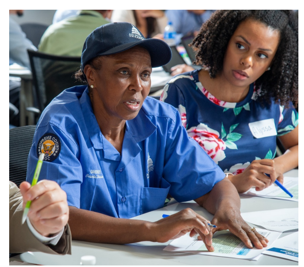
AOC EMPLOYEES ARE HIGHLY SKILLED, WELL-TRAINED AND EXTREMELY DEDICATED

The AOC has some of the most talented and widely admired craftsmen, tradesmen, artists, architects,